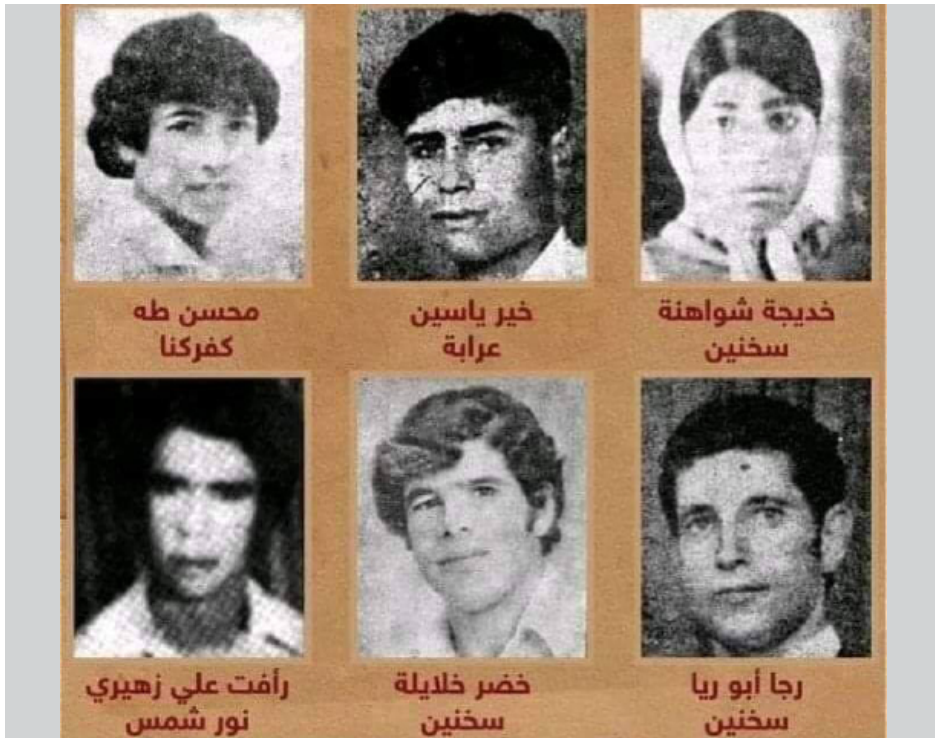
Land Day Martyrs