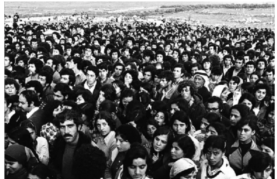
Land Day, 1976