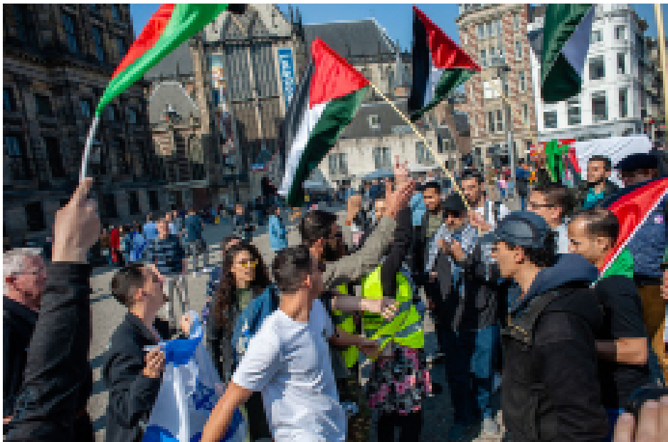
Land Day, Europe

At the end, it must be remembered that the land is still at the heart of our struggle, our existence and our future. Our survival and development are linked to the land and its preservation. The land issue is the most common issue in which national and militant dimensions are mixed. The struggle is far from over. Indeed, we can say that every day in Palestine is Land Day as Israel's ethnic cleansing of the Palestinians and their land continues apace. The open racism of the Zionist state has been acknowledged by major aid agencies, including B'Tselem , Human Rights Watch and Amnesty International . Israel seeks to delegitimise our struggle and our existence, not only steal our land.