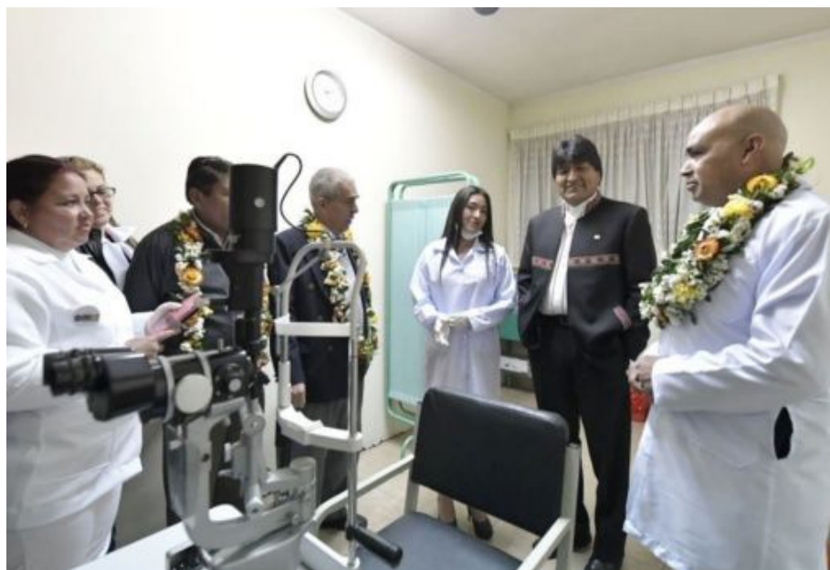
Photo 8. President Evo Morales with Cuban and Bolivian doctors in the framework of the "Operation Miracle" 22

Cuba maintained for 6 years the free operation of 40 hospitals and 15 ophthalmological centres in the country with the support of supplies. It was from 2013, as a result of an agreement signed between both nations, that the compensation of expenses for the stay of the Brigade in Bolivia and basic expenses was passed. At that time Cuba, donated to Bolivia all the facilities mentioned above.