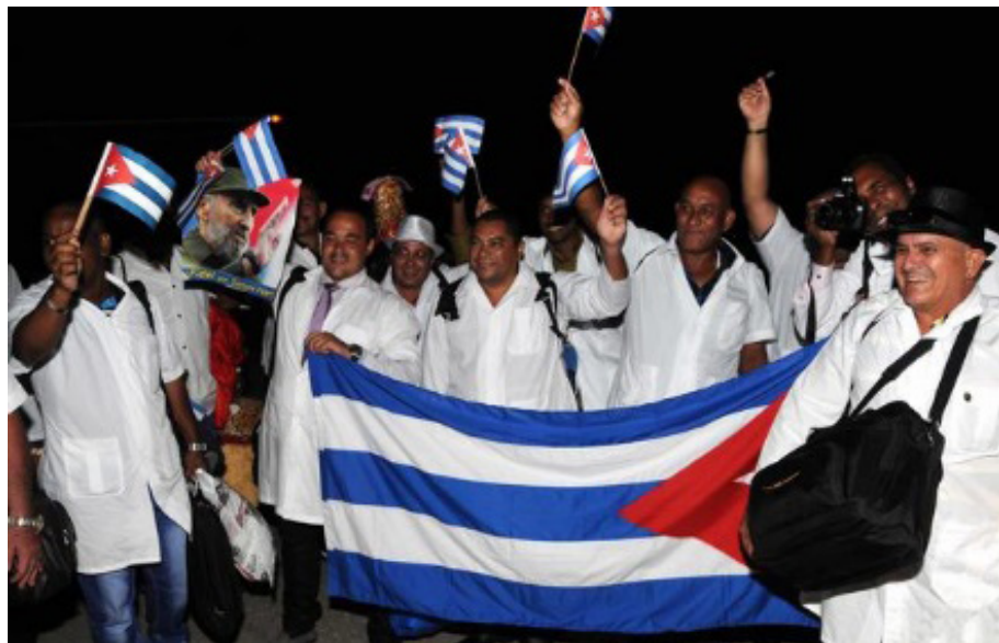
Photo 1. Cuban doctors on an internationalist mission