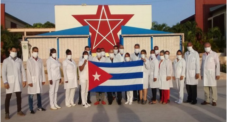
Photo 5. Cuban doctors from the Henry Reeve Brigade before leaving for Cape Verde

members of this contingent travelled to this West African state. It was made up of 11 professionals from five specialties, including 6 doctors and 3 nurses.