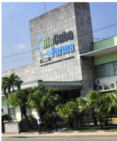
Photo 2. Biotechnology and Pharmaceutical Industries Group (BioCubaFarma)

Among the methods are the application of products such as the Bactivec biopesticide and Cypermethrin, which controls, through fumigation, the spread of the aedes aegypti mosquito. The Cuban vector control programme has also been applied in Zambia, Equatorial Guinea, Benin, Kenya and Tanzania. 4 The Biotechnology and Pharmaceutical Industries Group (BioCubaFarma), founded in December 2012 and which integrates the country's scientific hub, has played a fundamental role in these areas.