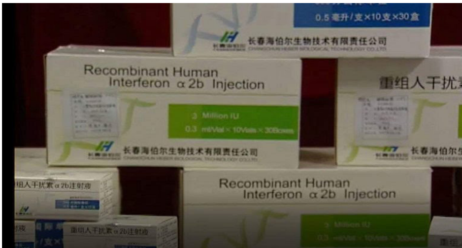
Photo 10. Cuban antiviral drug interferon alfa-2b

Like China, and despite being a small country, Cuba has a long tradition of medical cooperation that dates back to Algeria in 1963. In addition to collaborative medical missions, since the early 2000s, it has deployed specific brigades against exceptional situations grouped in the Henry Reeve International Contingent that has attended in cases of earthquakes (Pakistan 2005, Indonesia 2006, Peru 2007, China 2008, Haiti 2010, Chile 2010, Nepal 2015, Ecuador 2016), heavy rains (Guatemala 2005, Bolivia 2006, Mexico 2007, El Salvador 2009, Chile 2015, Venezuela 2015), medical emergencies (cholera in Haiti 2010, Ebola in Sierra Leone , Guinea, Liberia 2014) and hurricanes (Dominican 2015, Fiji Islands and Haiti 2016) and now with Covid-19 where it has deployed more than 1,370 health professionals to more than 22 countries. 21