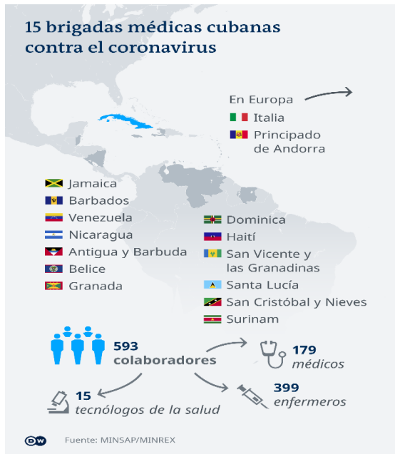
Map 2. 15 Cuban medical brigades against coronavirus in Central America and the Caribbean 25

The people were asked to comply with quarantine measures under the promise that the government would take the time to finish equipping hospitals, buy respirators, install Intensive Care Rooms, send tests to detect the coronavirus provide laboratories to the 9 departments in the country and provide biosecurity equipment for doctors and nurses. None of this was done by this false and corrupt government, which during five months of administering the health crisis has defrauded the Bolivian people.