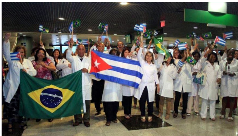
Photo 7. Cuban doctors in Brazil

It was in this context that the Brazilian president ended the Agreement between the government of Cuba and the Pan American Health Organization (PAHO), through which the participation of Cuban doctors in the More Doctors programme was guaranteed. President-elect Jair Bolsonaro made statements against Cuban cooperation; referring to the Cuban professionals (who made up some 60% of staff) as "slaves of the Cuban government".