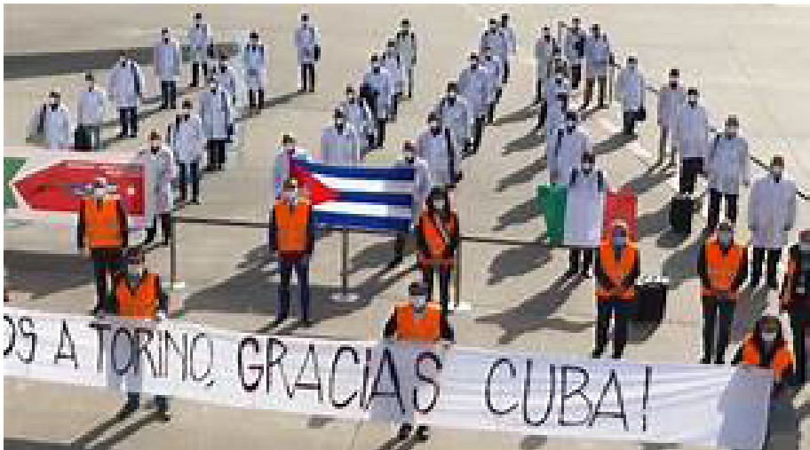
Photo 11. Cuban doctors in Lombardy, Italy

Italy is one of the countries where Euroscepticism is most pronounced and the slow response of Brussels to this serious crisis may have consequences on the view Italians hold of the EU. In this context, Russia sent 100 military virologists to Italy, epidemic specialists and a body of male and female nurses who came from three Russian military bases. According to the Russian Defence Ministry, these specialists have been involved in the elimination of swine flu in Africa and have also worked on the development of Ebola and plague vaccines. With the label “From Russia with love”, the planes and trucks carried giant stickers that linked the Italian and Russian flags in the shape of a heart. 3