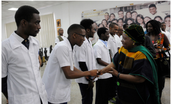
Photo 4. Exchange of the President of the AU Commission, N. Dlamini-Zuma, with African medical students in Cuba (October 2015)

Since the creation in 1999 of the Latin American School of Medicine (ELAM), thousands of students from Africa, Latin America and the Middle East have been trained in Havana. In this period, students came to Cuba through scholarships that were fully paid by the Cuban government. This programme was maintained despite the economic crisis of the 1990s.