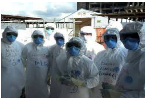
Photo 3. Cuban doctors in the fight against Ebola in West Africa.

This health epidemic marked another milestone in Cuba's medical collaboration with Africa. In this period, Cuba had 32 medical brigades on the continent, with a total of 4 048 collaborators, of them 2 269 were doctors. In particular, in Sierra Leone there were 23 aid workers and in Guinea 16. After a call by the World Health Organization, Cuba decided to strengthen its medical