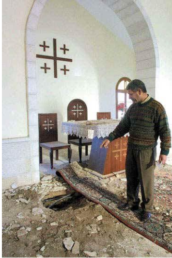
Gaza Baptist Church ceiling falling down

The plight of the Palestinian Christian is very much connected to that of the Palestinian Muslim in that both, whether in the Occupied Territories or inside Israel itself, are experiencing daily injustices at the hands of oppressive and discriminatory policies imposed on them by the Israeli government. The conflict is therefore not between Muslims and Christians; nor between the Greek Orthodox Church and the Palestinian Christians; it is between Palestinians as a whole and Israel's occupation and apartheid establishment. It is indeed hard to be Palestinian Christian. But it is equally hard being a Palestinian Muslim. It is hard simply being a Palestinian.