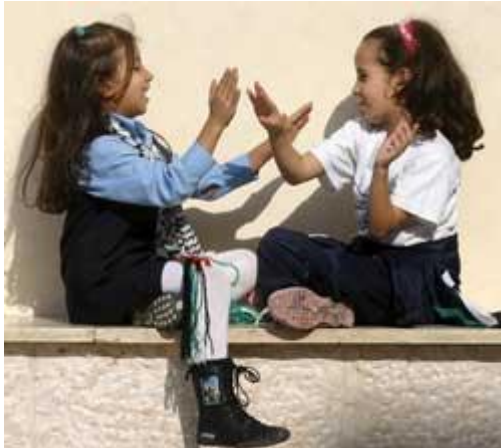
Palestinian Muslim and Palestinian Christian girls playing in the playground.